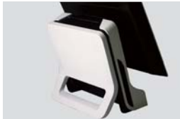
Fashionable back-side design.