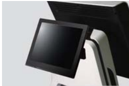
Dual LCD monitors.