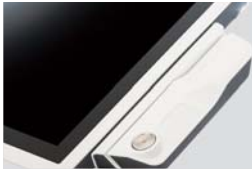
Magnetic card reader.