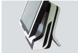
Flat touch screen.